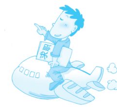
picture 4: ( )