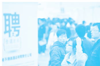
picture 2: ( )